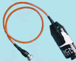
Mini ROV Mountable