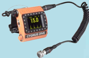
DIVE (Underwater A-Scan)