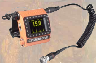
DIVE (Underwater A-Scan)