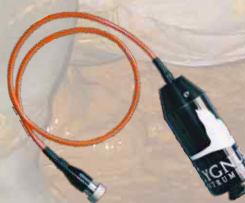
Mini ROV Mountable