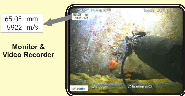
Monitor & Video Recorder

The Top Side Repeater can also superimpose the thickness measurements on to a composite PAL or NTSC video signal to display it on a monitor screen and/or the video recording of the survey. This provides a thickness measurement that can be linked to a position or place in the video recording.